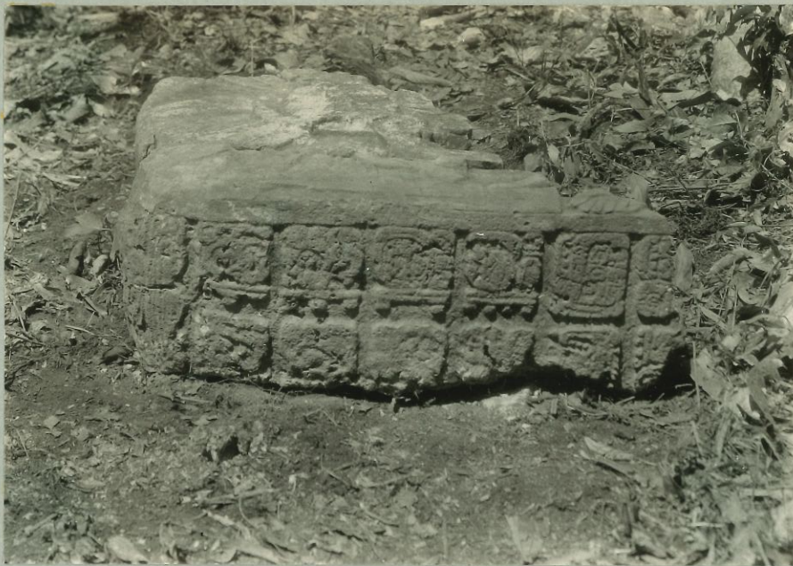
St 35 U.X. LEFT