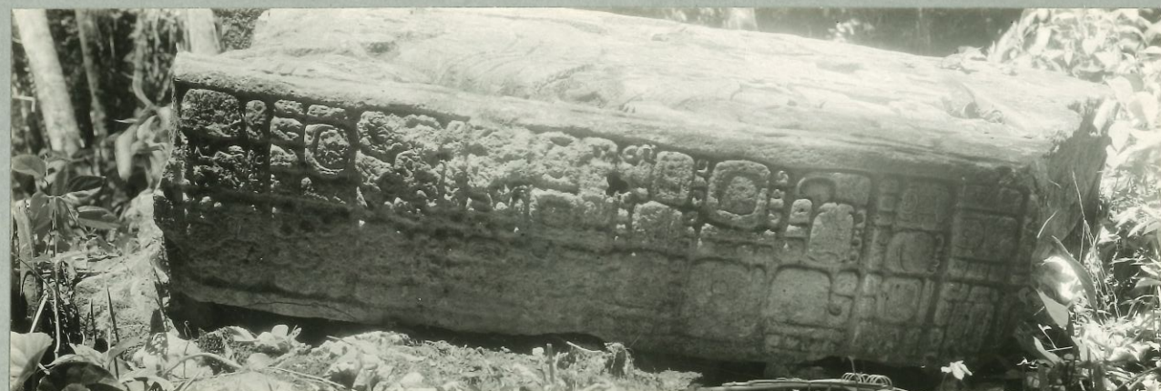
PN St. 8