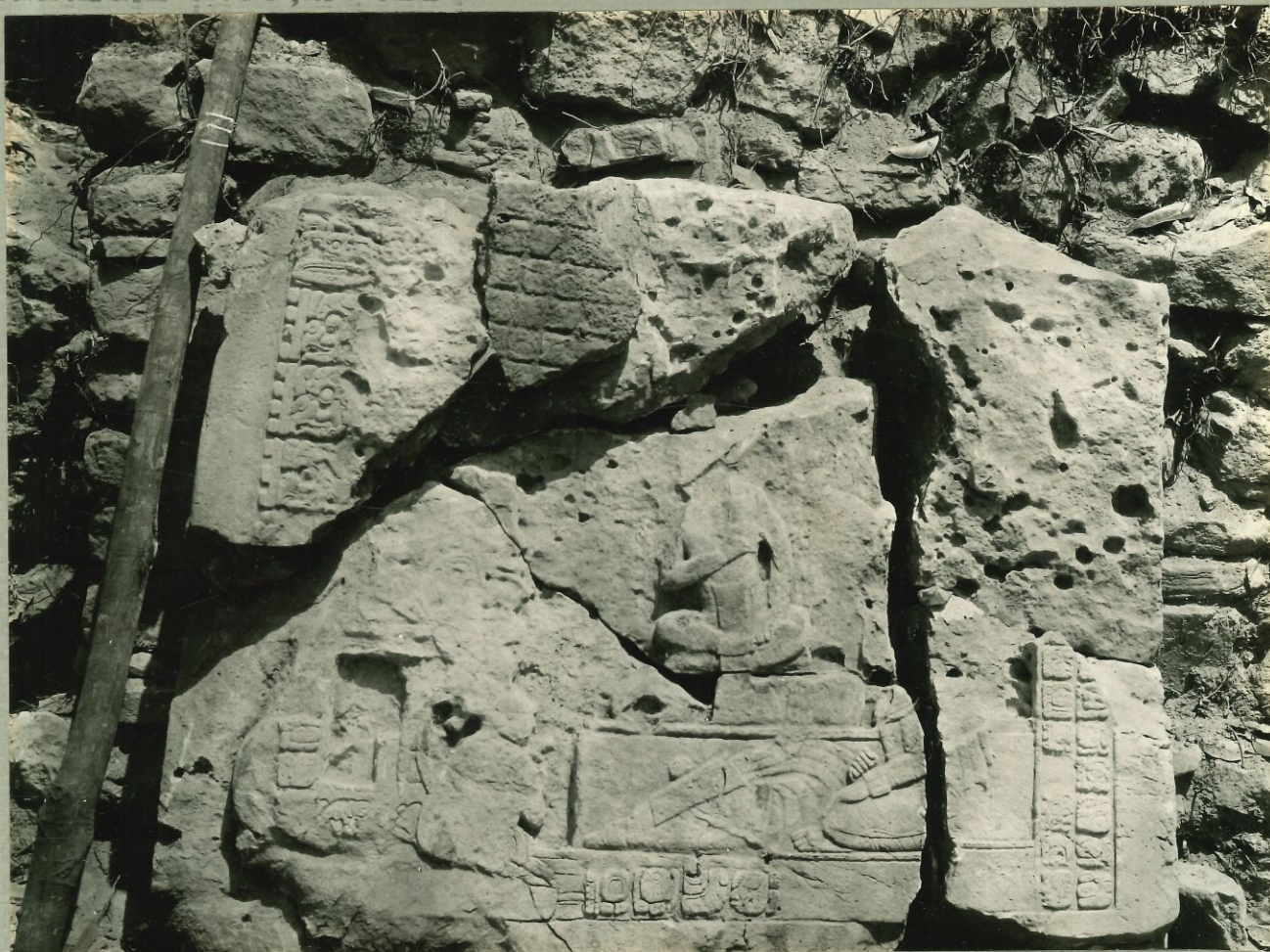
PIEDRAS NEGRAS GUAT. CARNEGIE INST, MORLEY