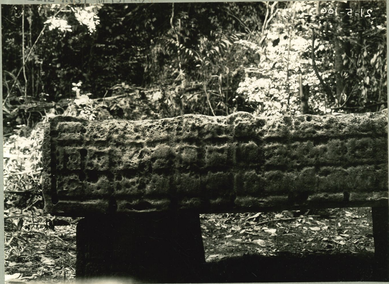
PIEDRAS NEGRAS GUAT. CARNEGIE INST MEXICO