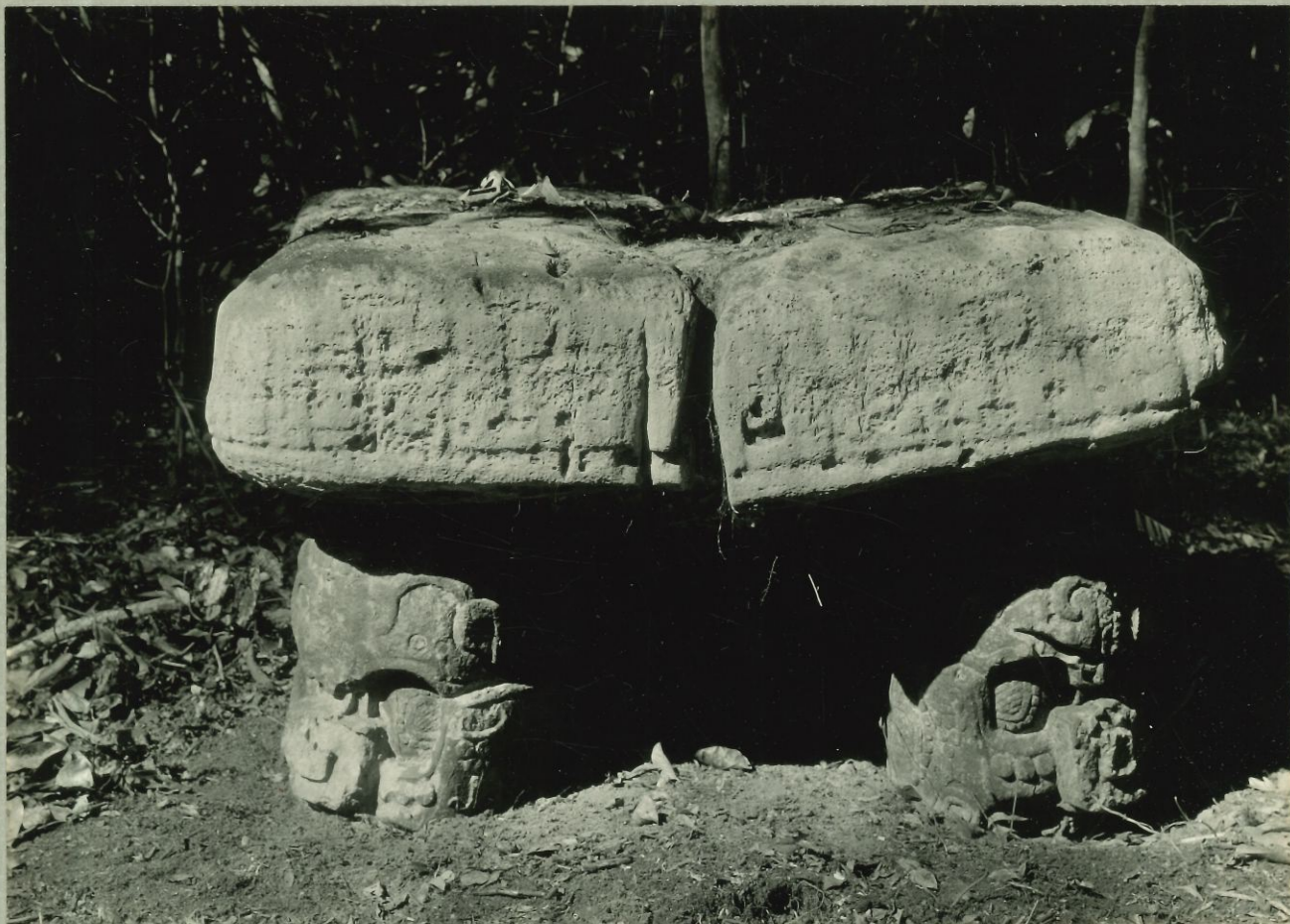
PIEDRAS NEGRAS QUAT. CARNEGIE INST, MORLEY