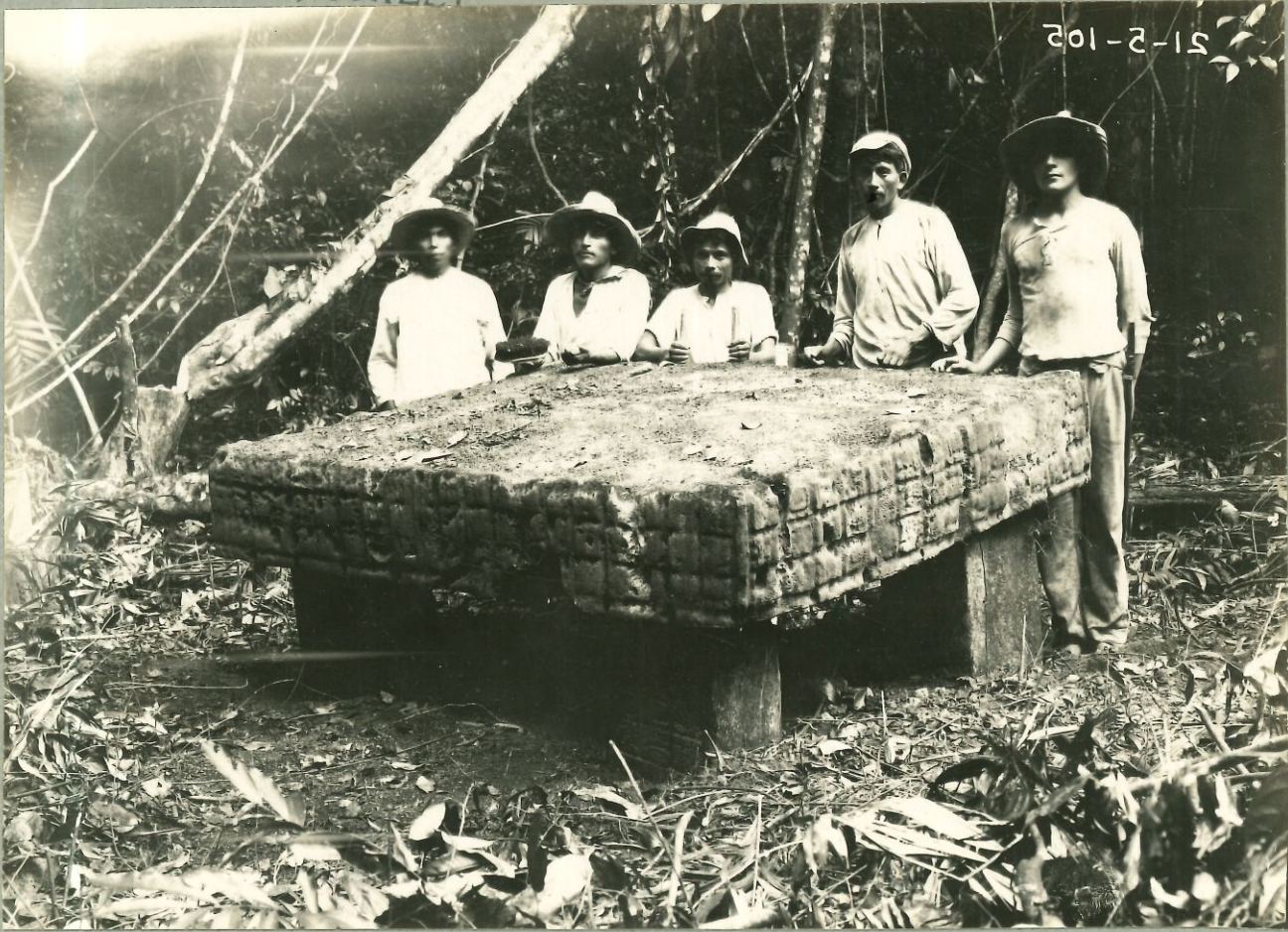
PIEDRAS NEGRAS GUAT. CARNEGIE INST, MORLEY