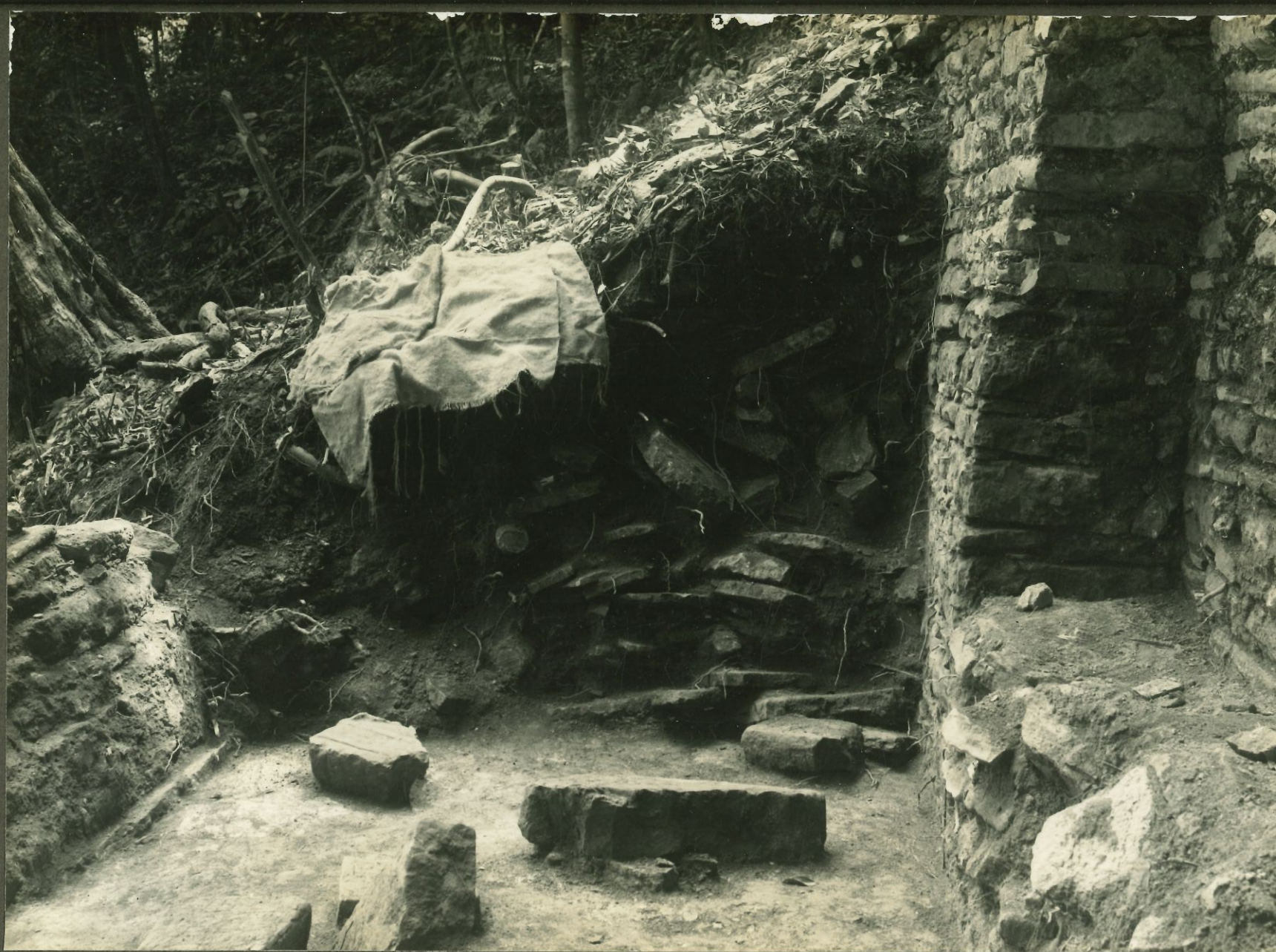
A CARVED STONE THRONE EMERGES FROM THE RUINS. THE PIECES SCATTERED IN ALL DIRECTIONS OVER THE FLOOR OF THE THRONE ROOM TELL A STORY OF PURPOSEFUL DESTRUCTION OF THE MASTERPIECE, LONG BEFORE THE SPANISH CONQUEST, PROBABLY BY ENEMIES OF THE PRIESTLY RULERS.