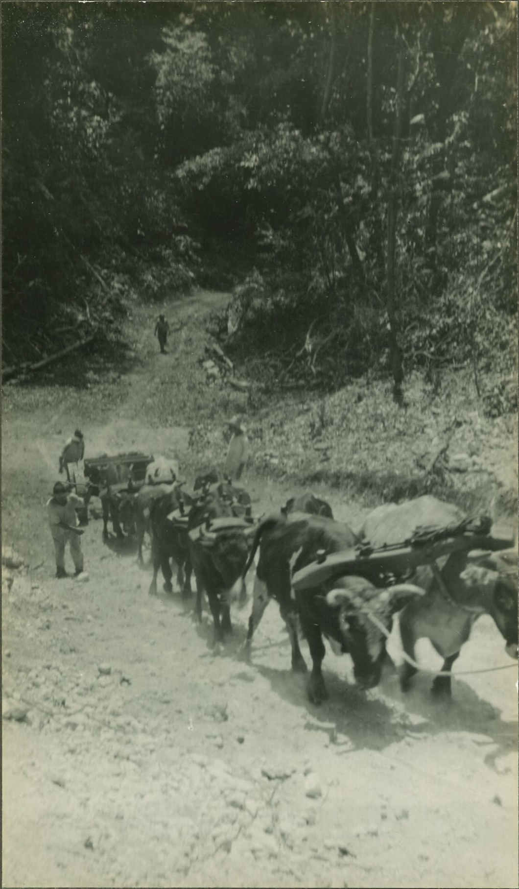
THE LONG HAUL AROUND THE UPPER RAPIDS. FIVE TEAMS OF BULLOCKS STRAINING UP A HILL WITH ONE OF THE GREAT MONUMENTS.