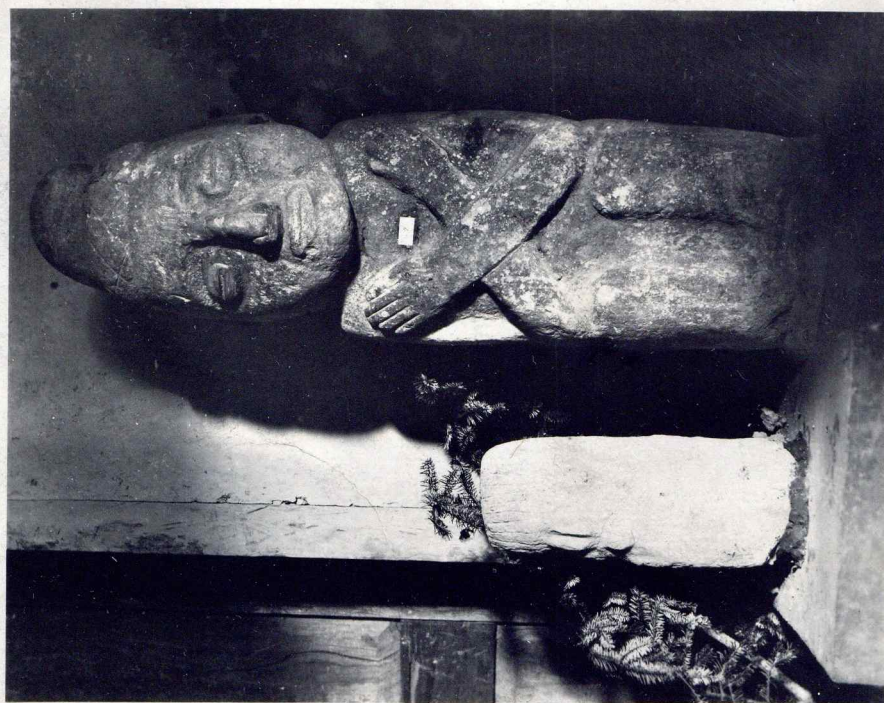
Journal 15/2 1st Plate b