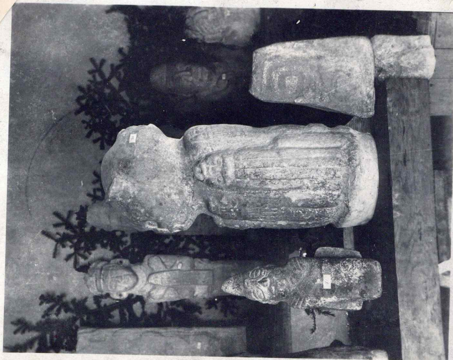
Journal 15/2 1st Plate a